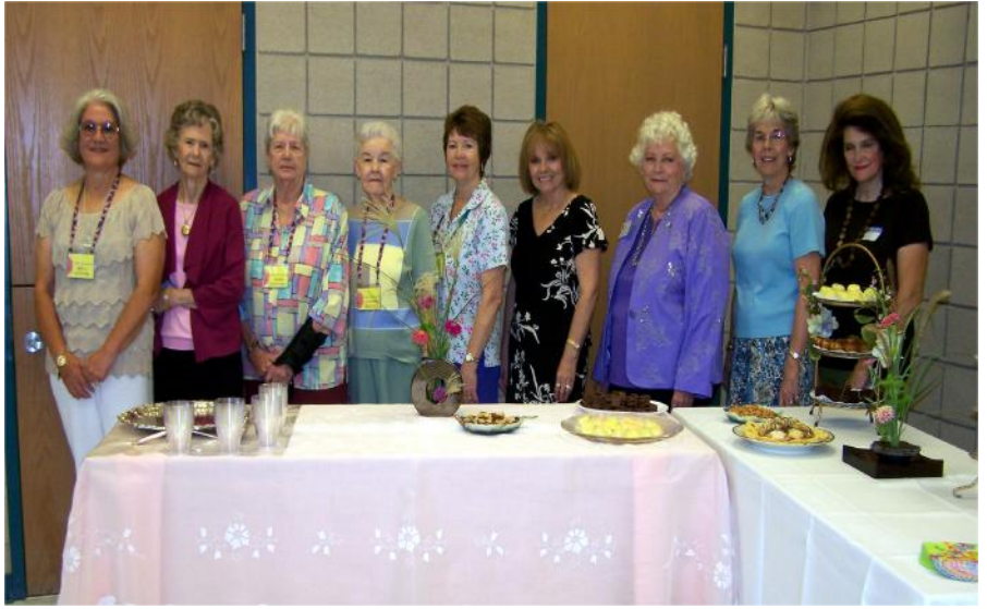
Congratulations to Land O' Lakes Garden Club in Lewisville who celebrated their 50th Garden Club Anniversary this Summer