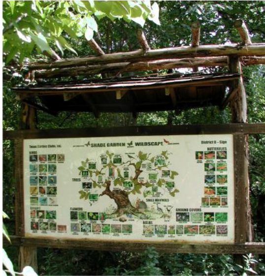
Educational Identification Wildscape Sign

These contributions should be shown on your President's Report. MANY THANKS! To Garden Club Council of Fort Worth who has also taken this project on as their project. Please support this endeavor to help educate our children and adults at TGCHQ.