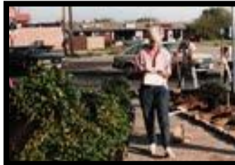
1988 Main & NW Hwy Landscape Project

The NGC, a not-for-profit educational organization with its headquarters in St. Louis, Missouri, is recognized as the largest volunteer gardening organization in the world. It is composed of fifty State Garden Clubs and the National Capital Area, 6,218 member garden clubs, and 198,595 members.