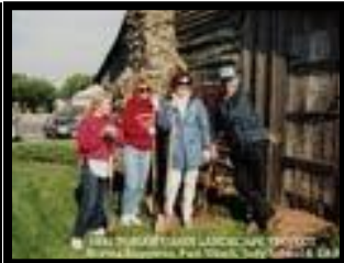
1990 Torian Cabin Landscape Project